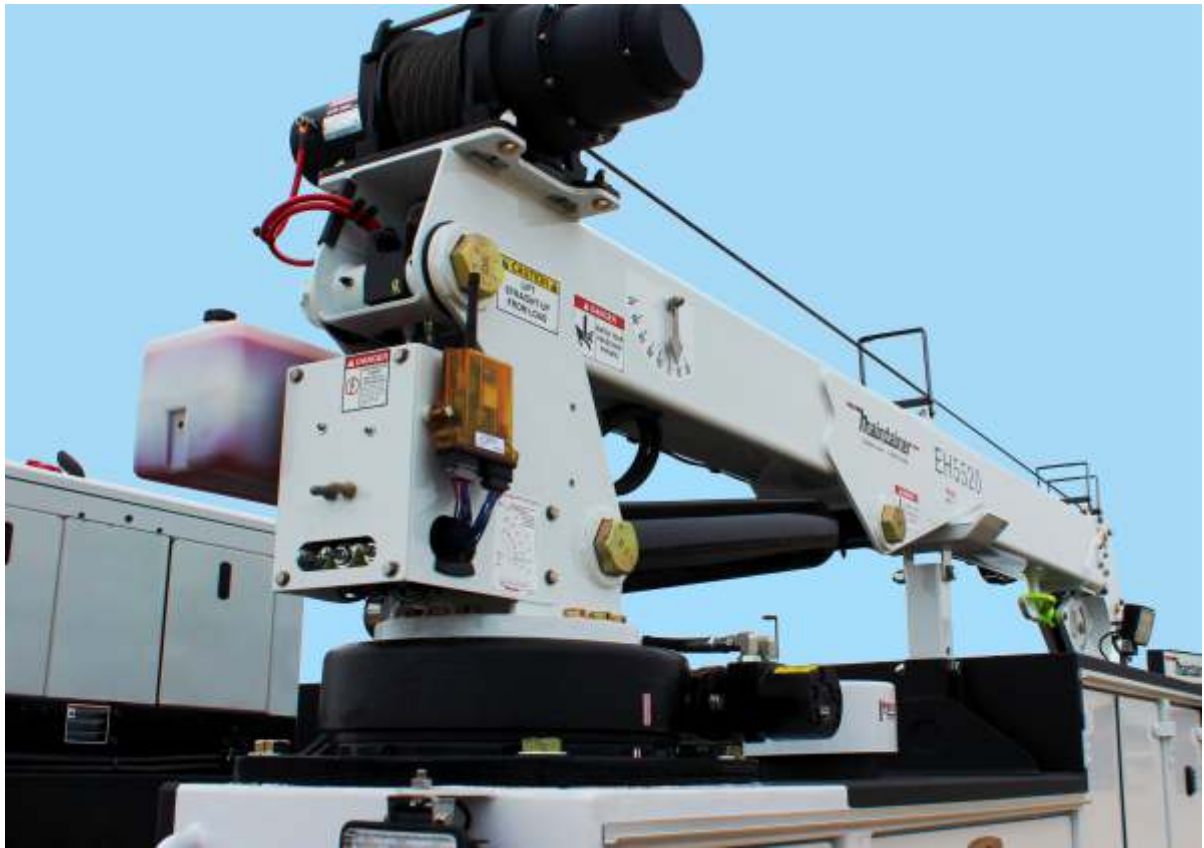
Crane shown is EH520